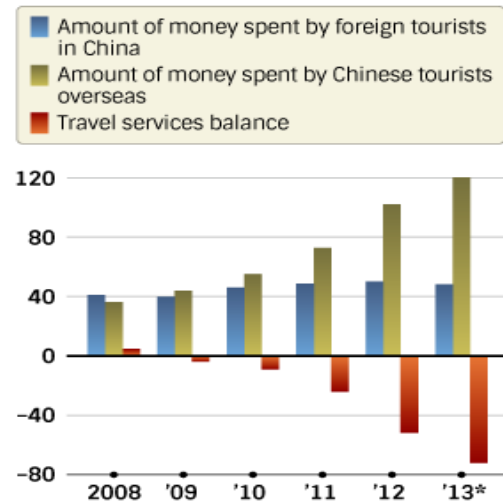
China's rapidly expanding travel services deficit; in billions of dollars

*China Tourism Academy for 2013 data only